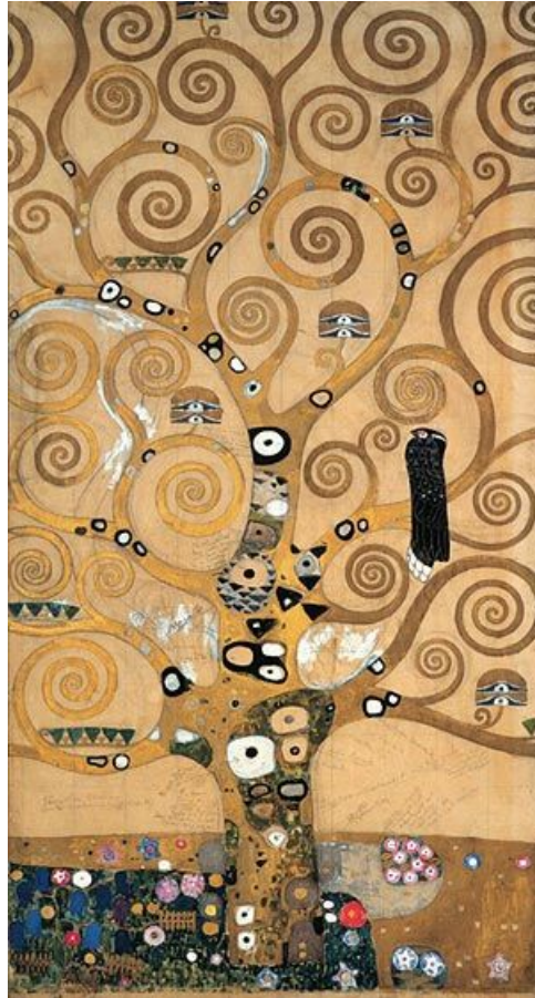
Figure 1: Example of an art nouveau image from Gustav Klimt ‘Tree of Life’

Taking our inspiration from this art movement, we will focus on curved lines in particular ‘parametric curves’ that can be used to control plotting out circular and curved forms with a focus on spirals. In addition, this lab is inspired by the use of repetitive organic shapes (for example the rich tiled elements in many of Gustav Klimt’s pieces).